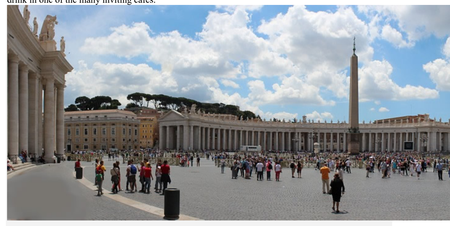
St Peter's Square, Vatican City

We've reserved a little free time this afternoon to explore Rome on your own, at your pace. Perhaps you'll head straight for the famous Trevi Fountain – don't forget to throw your coins in to ensure your return to Rome! You may be tempted by a genuine Roman gelato or perhaps an after-dinner drink in one of the many inviting cafes.