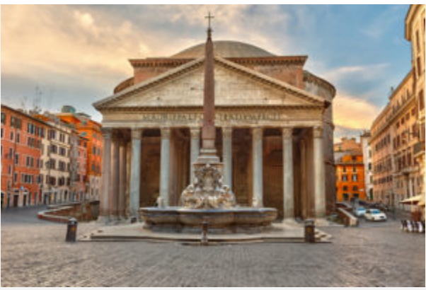
Fabulous Pantheon, site of the Oculus and the burial place of Raphael

Dinner this evening at one of our favorite local restaurants.