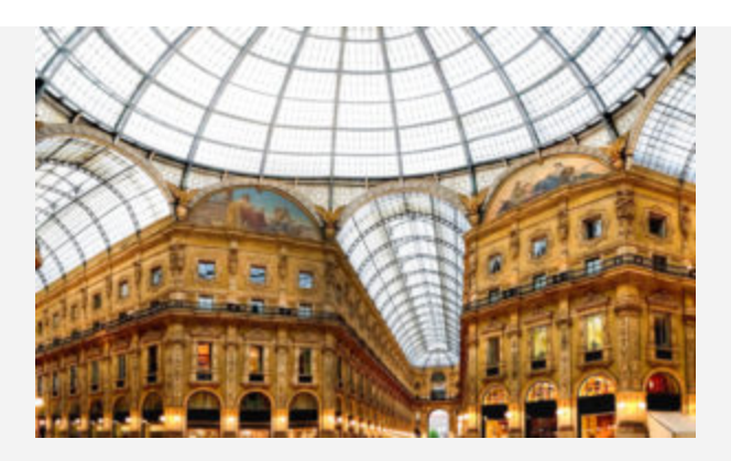
Fabulous Milano Shopping

From the comfort of your deluxe motor coach we embark on an orientation tour of some of the most famous landmarks of Milan, including the Sforzesco Castle , the aforementioned Vittorio Emanuel Gallery, Piazza Duomo – famous for the Gothic Cathedral – and of course La Scala Opera House. Enjoy a farewell to Italia dinner at one of our favorite Milanese restaurants.